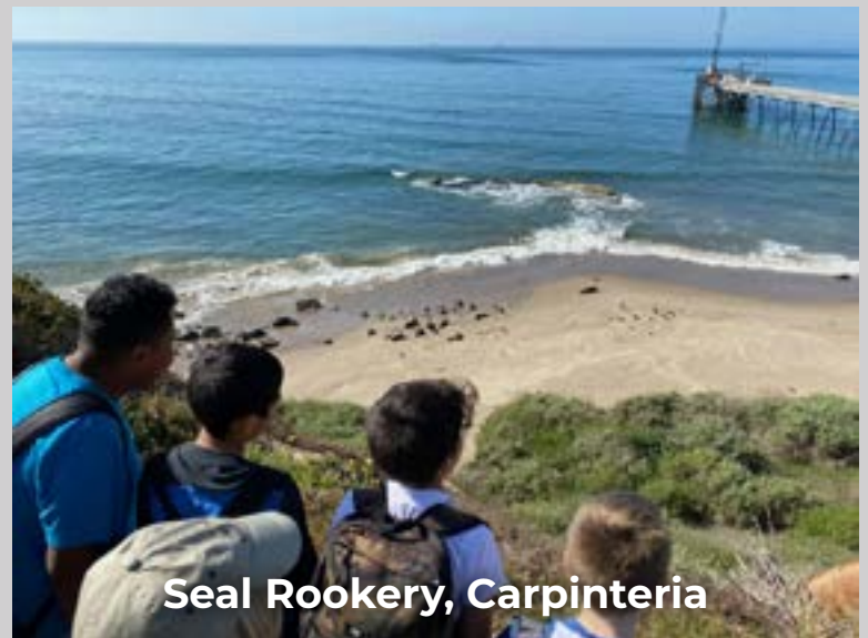
Seal Rookery, Carpinteria