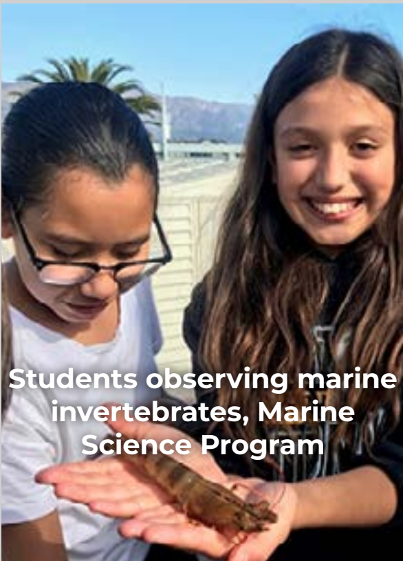
Students observing marine invertebrates, Marine Science Program