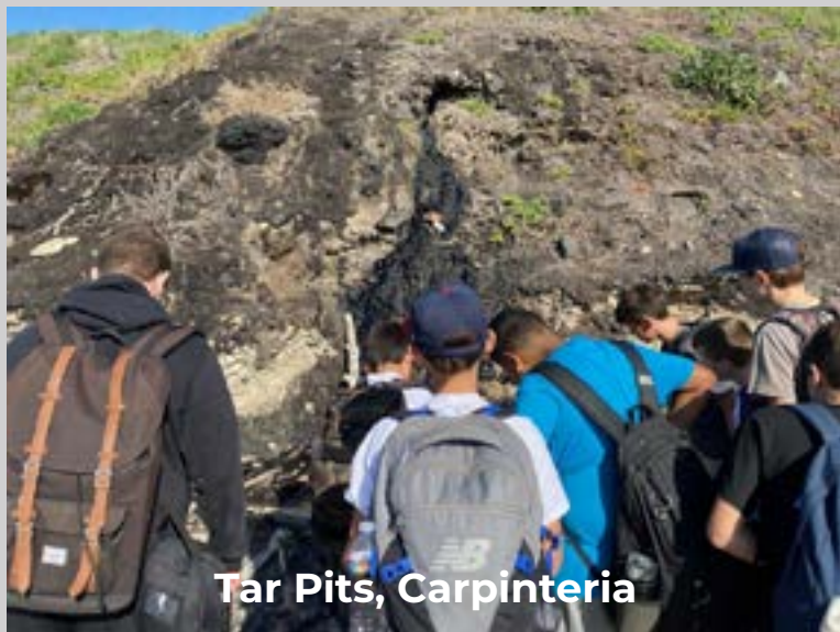
Tar Pits, Carpinteria