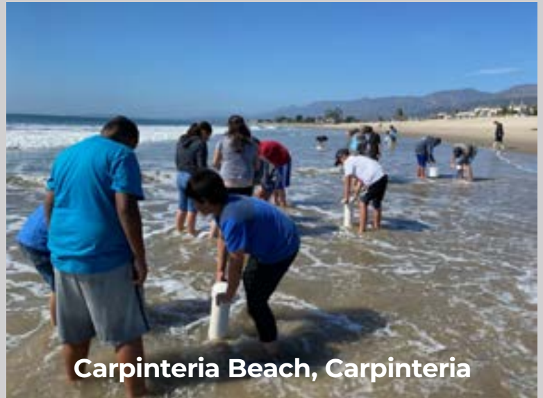
Carpinteria Beach, Carpinteria