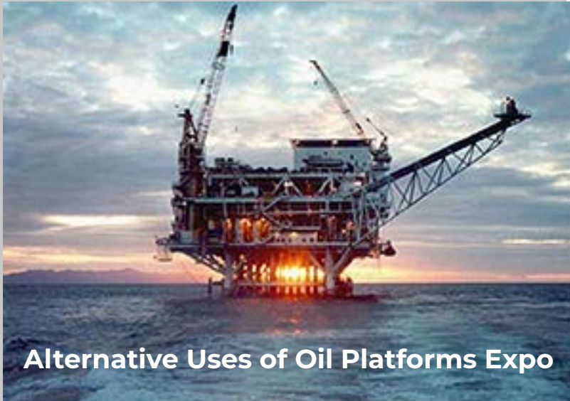
Alternative Uses of Oil Platforms Expo